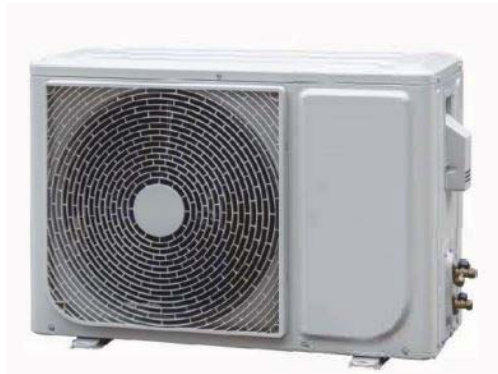
Outdoor Unit (GOU)