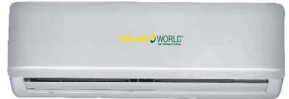
Wall Mount Indoor Unit (IDU)